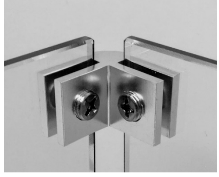
Foot Bracket with Set Screws Corner Bracket with Set Screws

Place Glass Pane #1 (for rectangular, use long pane) on a prepared surface. With the Foot Bracket Assembly Screw holes facing upward, slide one lower corner of the Glass Pane into the slot on the Flame Guard Foot. Tighten the Set Screw with plastic nib to secure the Glass Pane to the Foot Bracket.